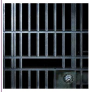
<u>Jefferson County Most</u> Wanted