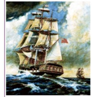
Fort Discovery History